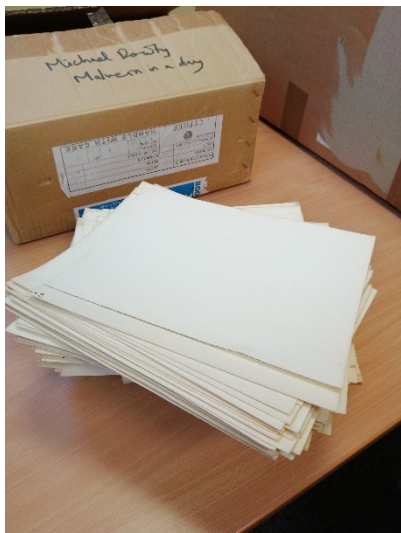
Original storage of photographs