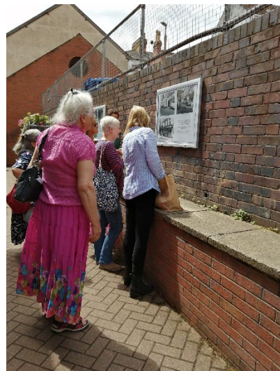
Visitors to the exhibition